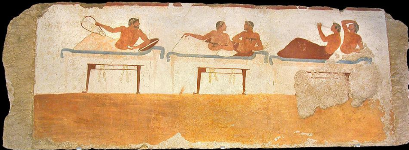
Image courtesy of Jean-Pierre Dalbéra . Source: Wikimedia Commons. License CC BY.