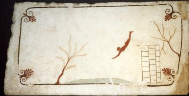
Image courtesy of Jean-Pierre Dalbéra . Source: Wikimedia Commons. License CC BY.