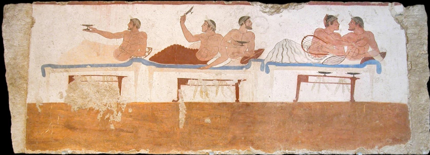
Image courtesy of Jean-Pierre Dalbéra . Source: Wikimedia Commons. License CC BY.