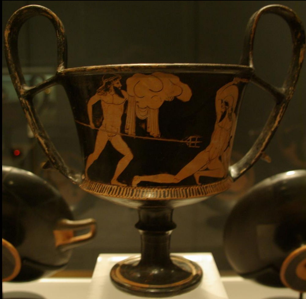
License CC BY-NC-SA.